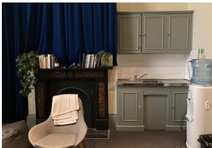
Image: Quiet space kitchenette and book shelf