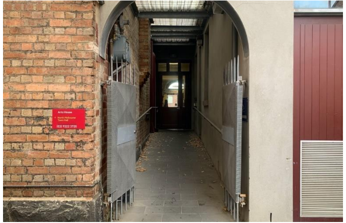
Image: view of the ramp with grab rail leading from George Johnson Lane to the automated door which opens into the Arts House foyer.