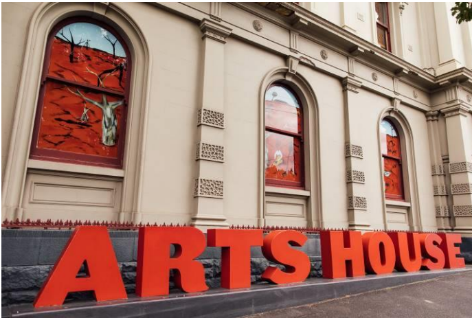
Image: North Melbourne Town Hall view from Queensberry Street which features giant red letters that say ARTS HOUSE out the front of it.