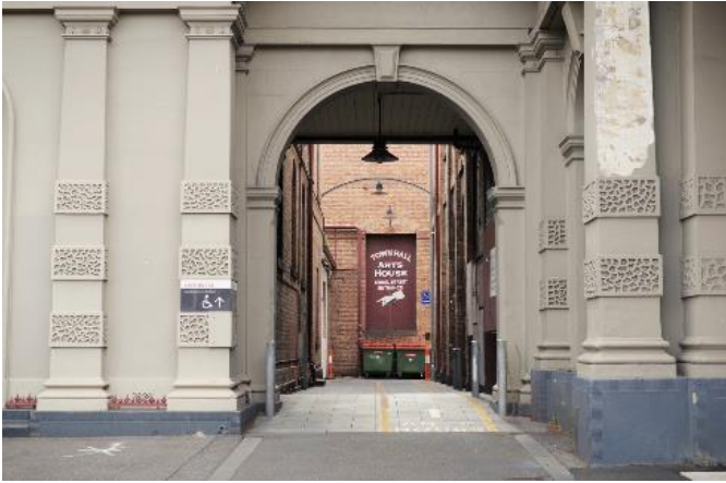
Image: View of George Johnson Lane from Errol St. The laneway passes through an archway with a brick wall at the end.

The second Accessible Entrance is towards the end of George Johnson Lane.