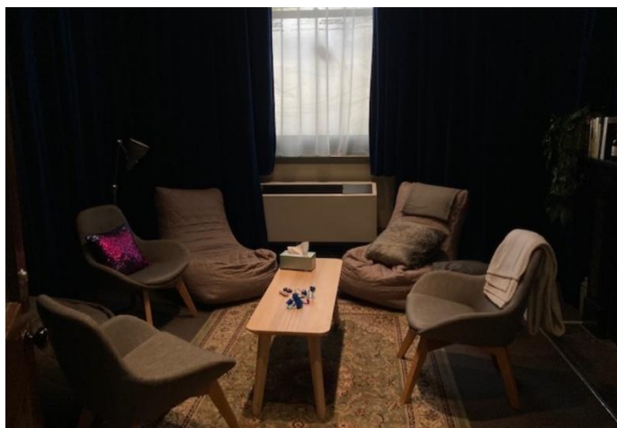
Image: Quiet space with lights dimmed

Arts House Quiet Space is located on Ground Level and is nearby reception and opposite the accessible bathrooms. It includes a range of seating options including soft furnishings, dimmable lights, sensory and stim objects. It is open during venue opening hours and events as a quiet space, prayer or parenting space.