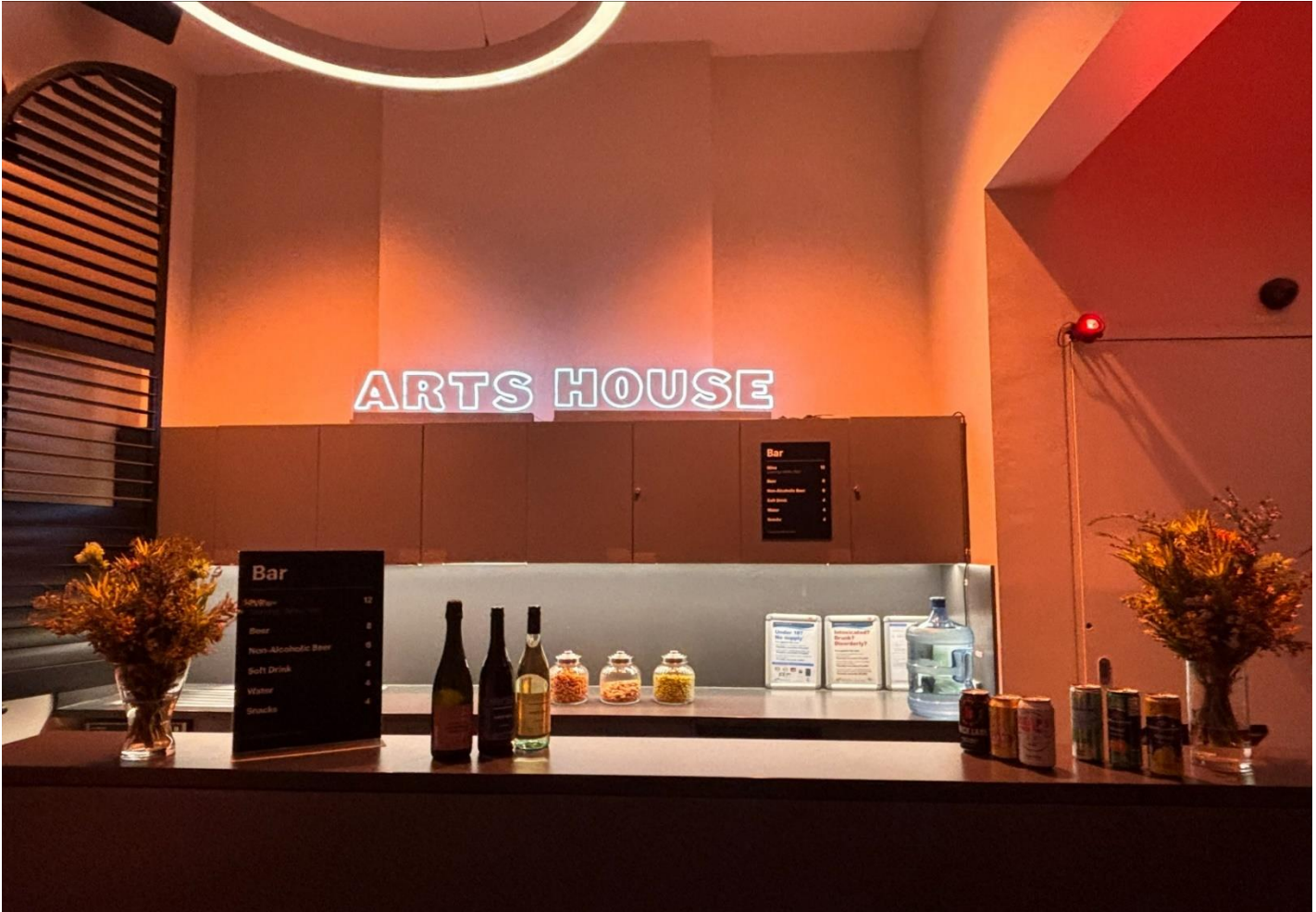
Image Description: The Arts House Bar with vases on each side of the bar filled with native flowers. In the centre there is a bar menu displayed with drinks set up on the top level on the bar. Towards the back wall there is a Arts House sign that is lit up. The lighting of the space is lit up orange.

The bar is to the Bar staff will be wearing black with an Arts House Logo.