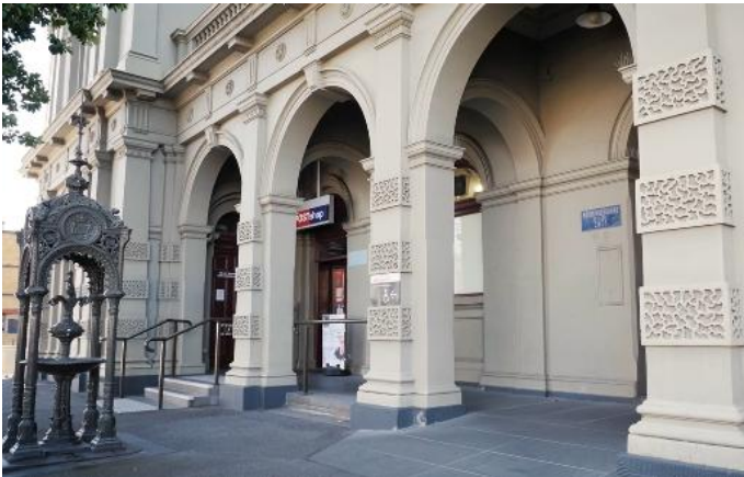
Image: Errol Street entrance next to the Post office with wheelchair accessible ramp or two steps with grab rails.

There are two Wheelchair Accessible Entrances. The first is on Errol St next to the Post Office.