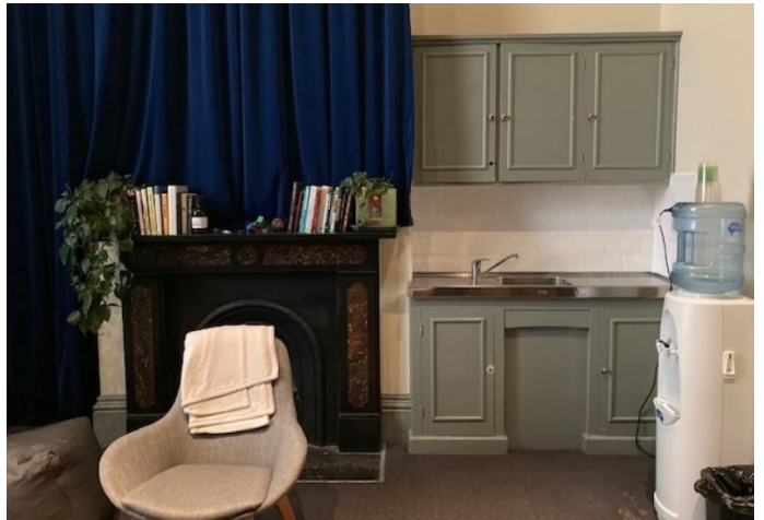
Image: Quiet space kitchenette and book shelf