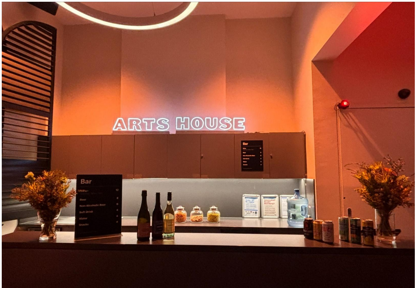
Image Description: The Arts House Bar with vases on each side of the bar filled with native flowers. In the centre there is a bar menu displayed with drinks set up on the top level on the bar. Towards the back wall there is a Arts House sign that is lit up. The lighting of the space is lit up orange.

Bar staff will be wearing black with an Arts House Logo.