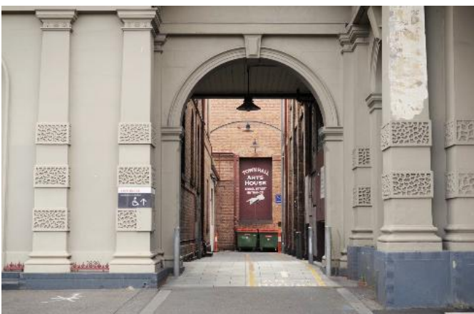
Image: View of George Johnson Lane from Errol St. The laneway passes through an archway with a brick wall at the end.

The second Accessible Entrance is towards the end of George Johnson Lane.