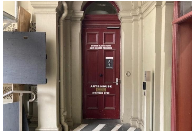
Image: View of door at Post office entrance. Button to open automated door is on the right.

The second Accessible Entrance is towards the end of George Johnson Lane.