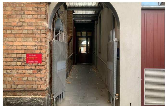
Image: view of the ramp with grab rail leading from George Johnson Lane to the automated door which opens into the Arts House foyer.