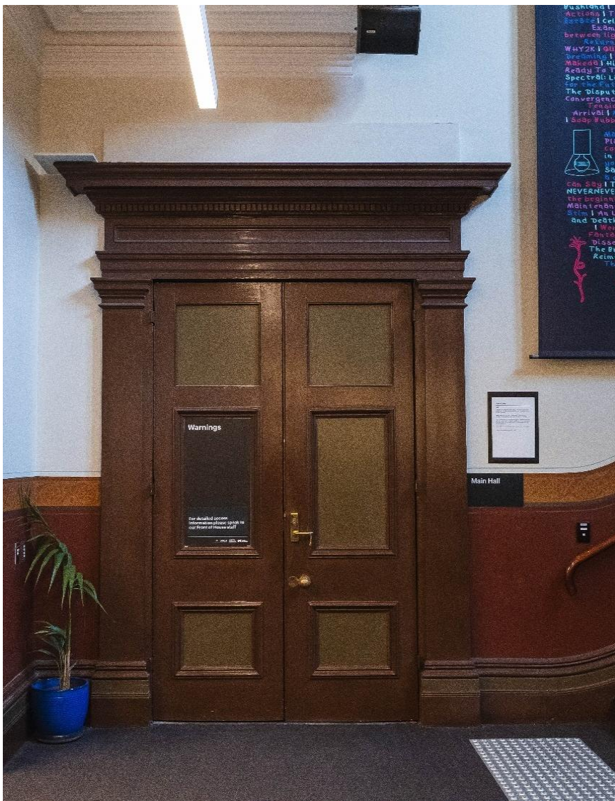
Image: Doors to the Main Hall.

An artist statement is available on signage and warnings on the door.