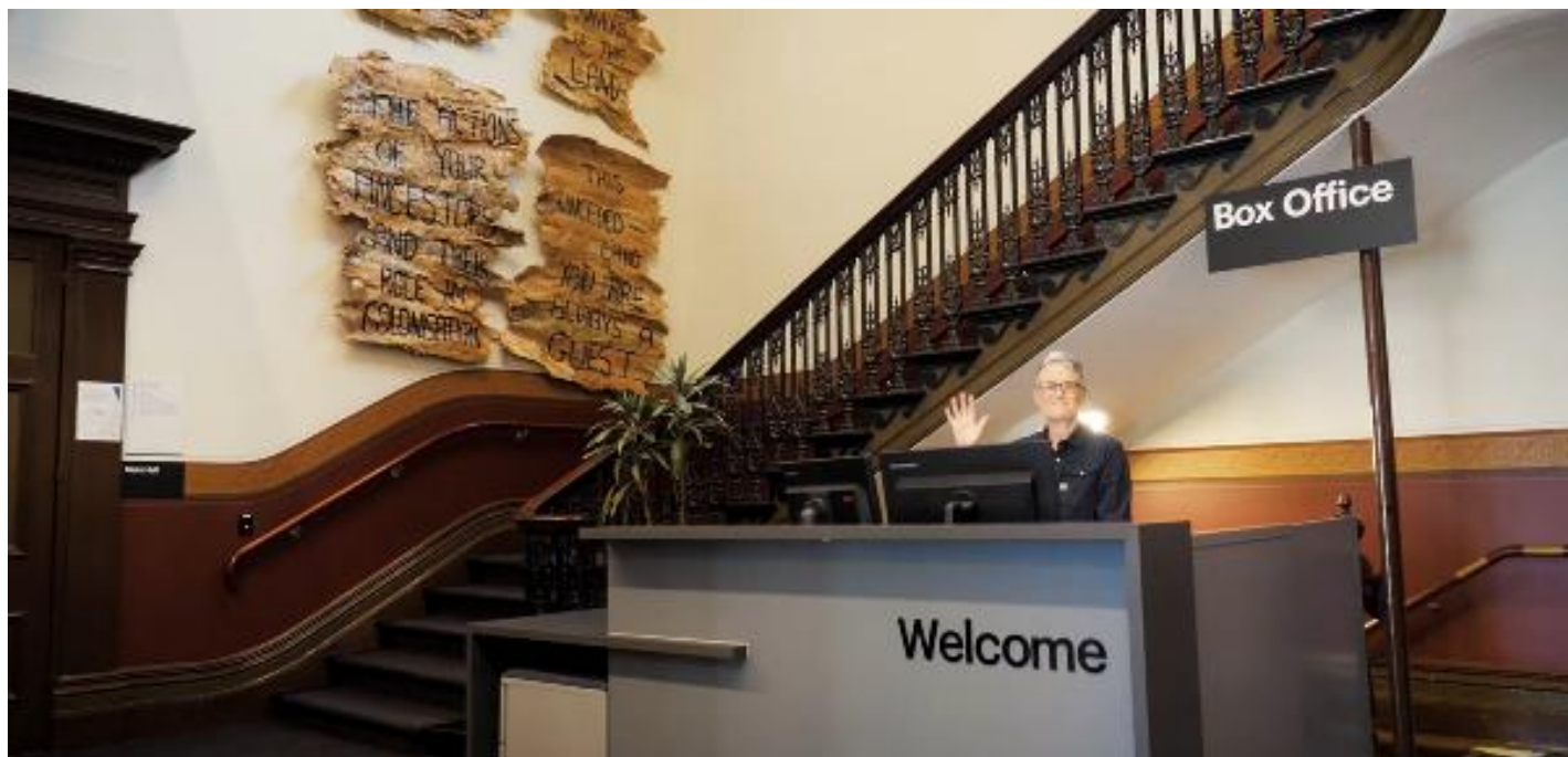
Image: The Box Office is located in the foyer under the stairwell. If you enter from the Main Entrance it should be straight ahead of you. If entering from the Post Office or George Johnson lane your should approach on its right hand side.