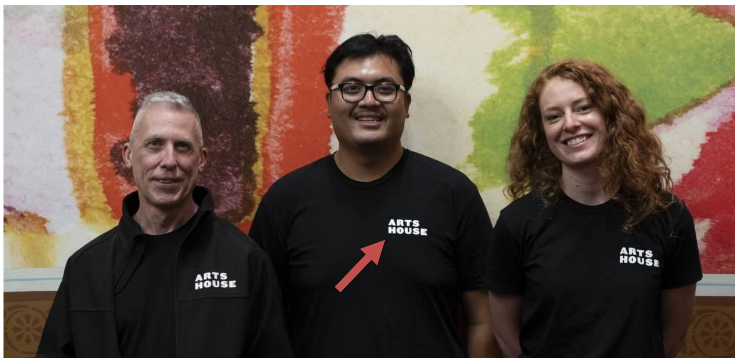
Image: Ushers wearing black tops with an Arts House Logo on the left hand shoulder.