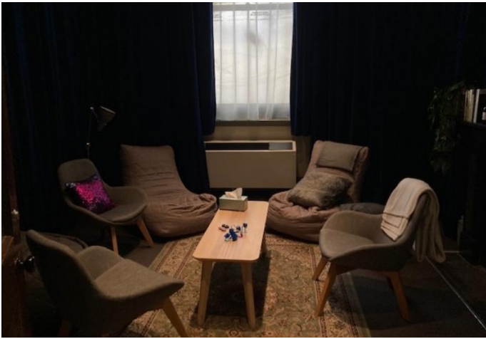
Image: Quiet space with lights dimmed

Arts House Quiet Space is located on Ground Level and is nearby reception and opposite the accessible bathrooms. It includes a range of seating options including soft furnishings, dimmable lights, sensory and stim objects. It is open during venue opening hours and events as a quiet space, prayer or parenting space.