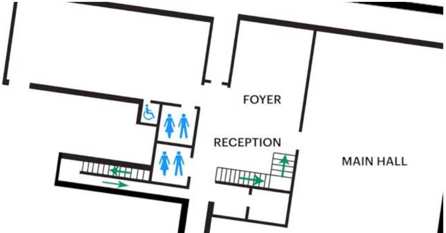
Image: Map of the bathrooms located on the ground floor. All of the bathrooms at Arts House are unisex.

All bathrooms have Dyson hand dryers with sensor activation. There is an accessible bathroom that is single use on ground level opposite the Quiet Space. There is another accessible bathroom upstairs – this is accessible via lift or stairs.