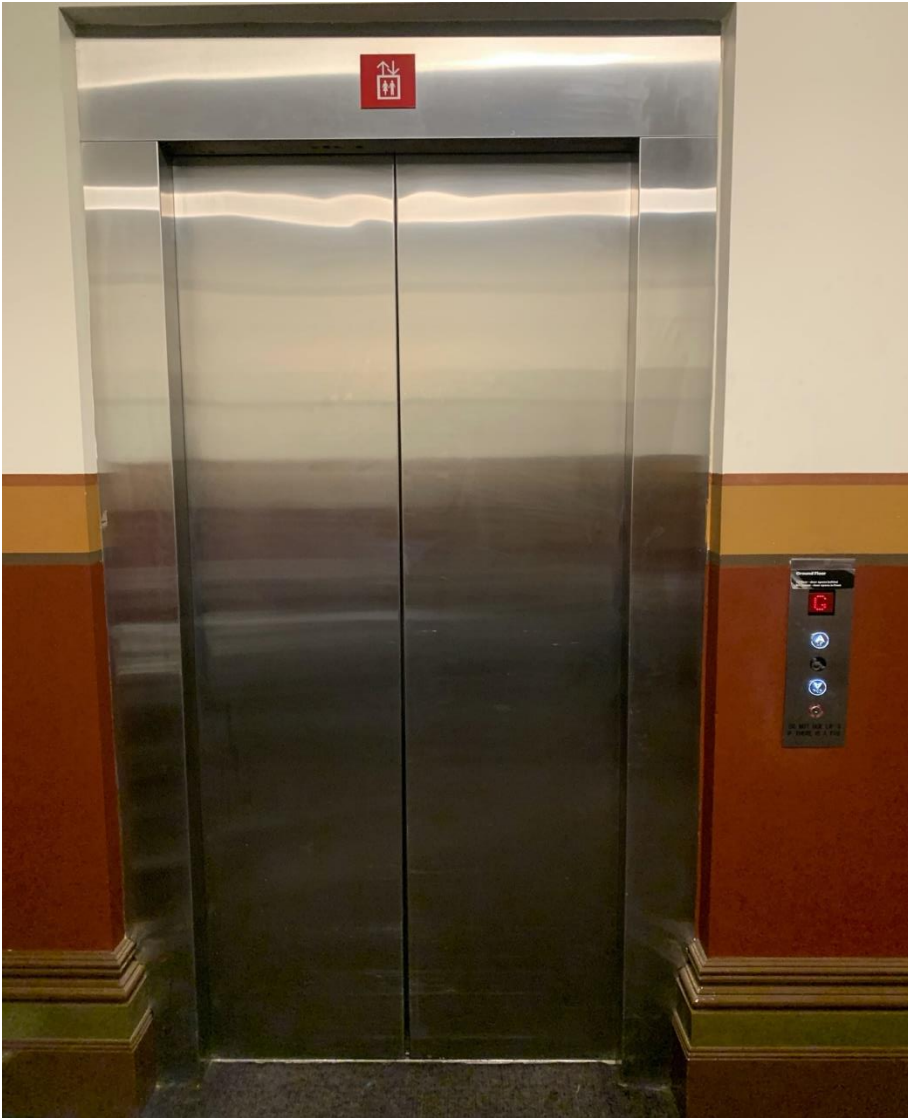
Image: The elevator. Located behind the Box Office desk on the ground floor foyer.

The closest entry to the lift is via George Johnson Lane.