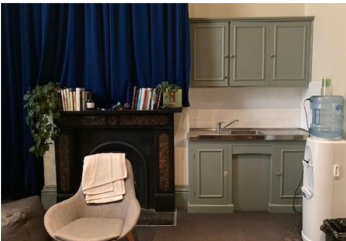
Image: Quiet space kitchenette and book shelf