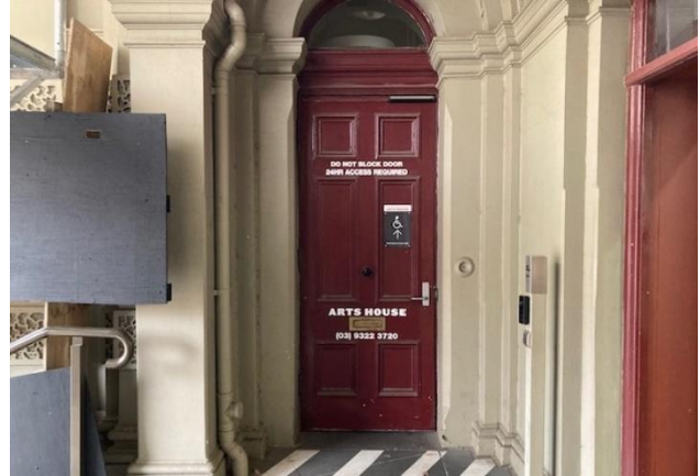
Image: View of door entrance.

Image: Errol Street entrance next to the Post office with wheelchair accessible ramp or two steps with grab rails.