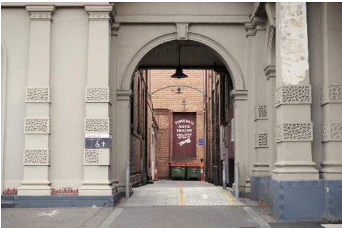
Image: View of George Johnson Lane from Errol St. The laneway passes through an archway with a brick wall at the end.

The second Accessible Entrance is towards the end of George Johnson Lane.