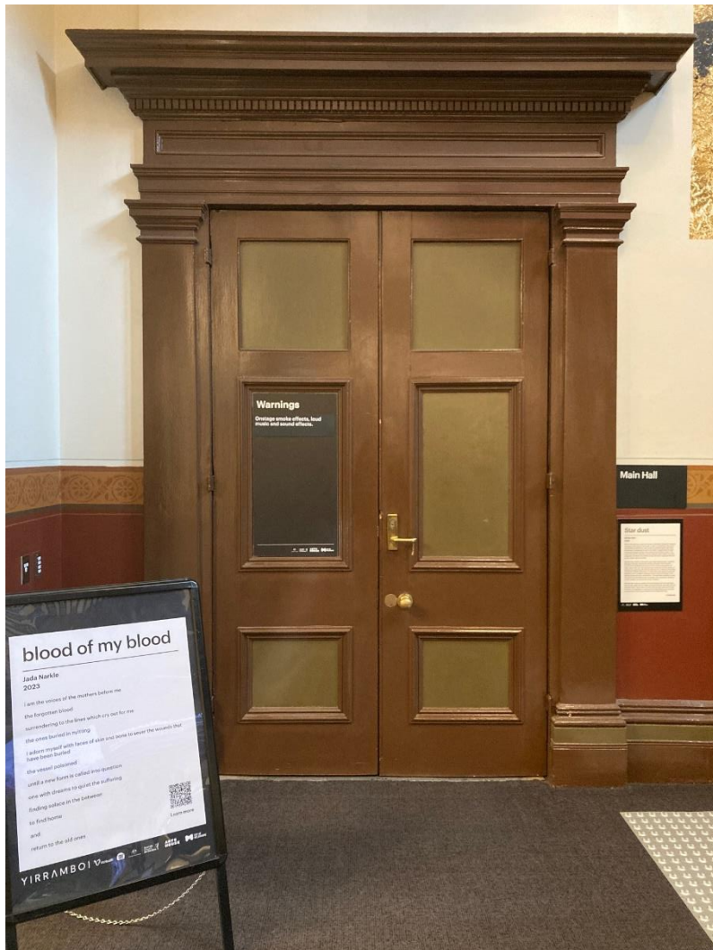
Image: Doors to The Main Hall.

An artist statement is available on signage and warnings on the door.