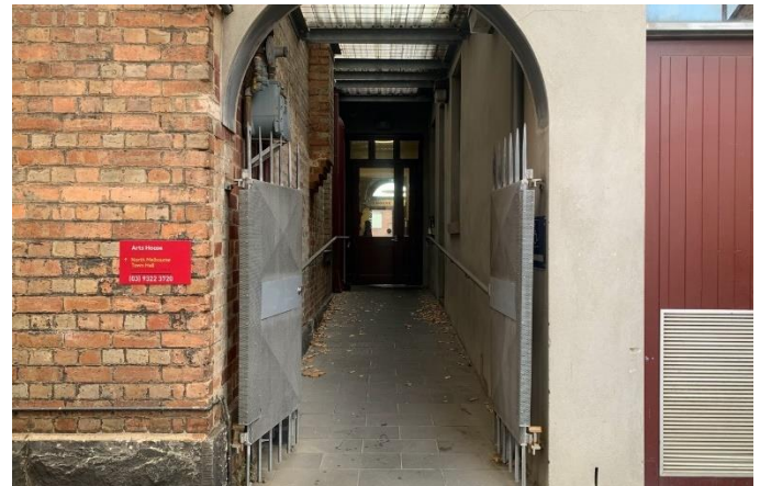
Image: view of the ramp leading from George Johnson Lane to the automated door which opens into the Arts House foyer.

Image: View of George Johnson Lane from Errol St. The laneway passes through an archway with a brick wall at the end.