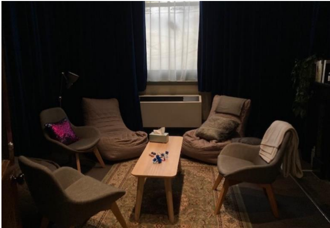
Image: Quiet space with lights dimmed

Arts House Quiet Space is located on Ground Level and is nearby reception and opposite the accessible bathrooms. It includes a range of seating options including soft furnishings, dimmable lights, sensory and stim objects. It is open during venue opening hours and events as a quiet space, prayer or parenting space.