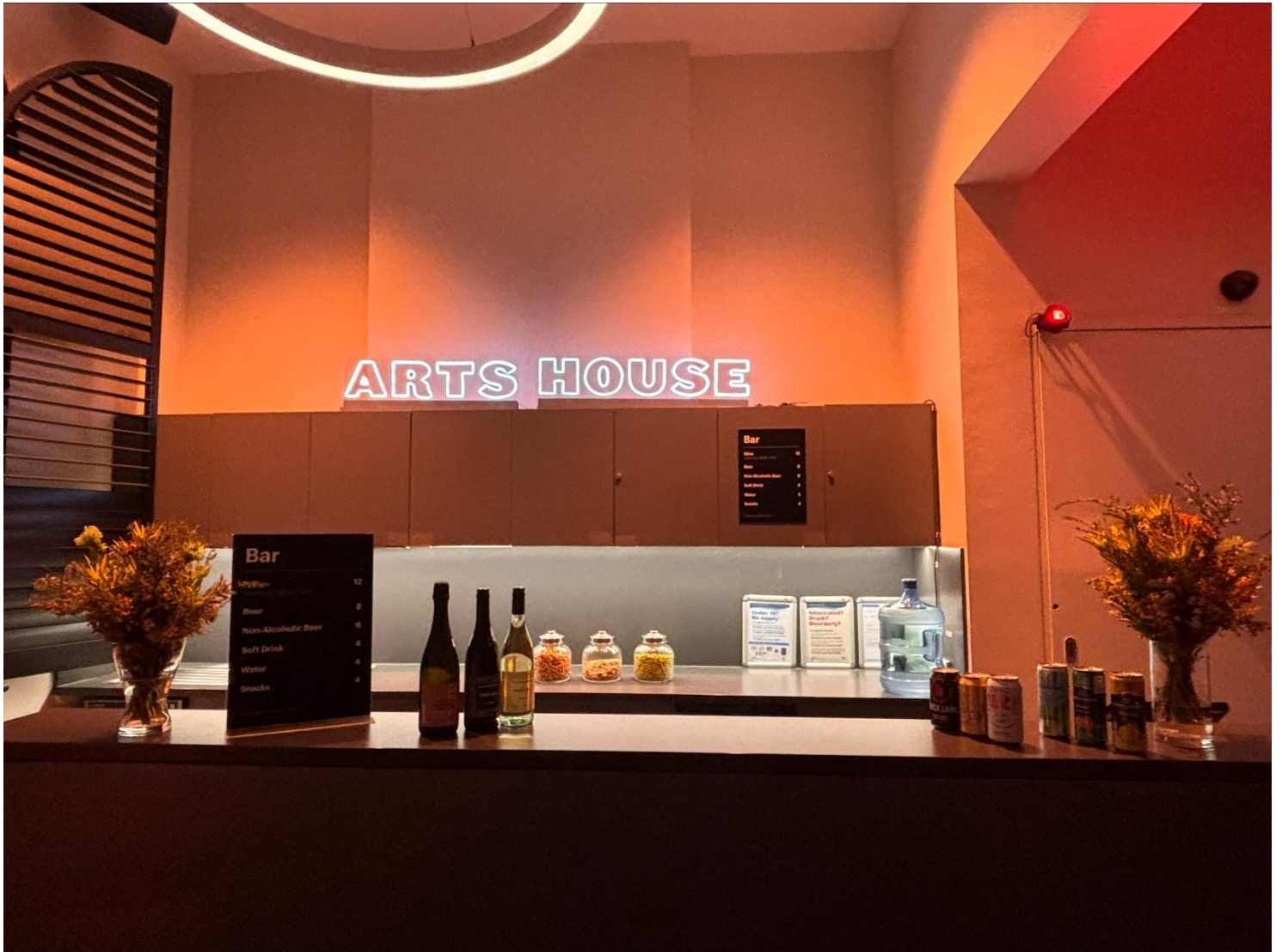
Image Description: The Arts House Bar located on the ground floor.

Bar staff will be wearing black with an Arts House Logo.