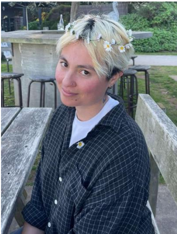
Image description: A photo of a non-binary man sitting outdoors at a picnic table, wearing a flower crown. They have platinum blonde hair and are smiling to the camera.