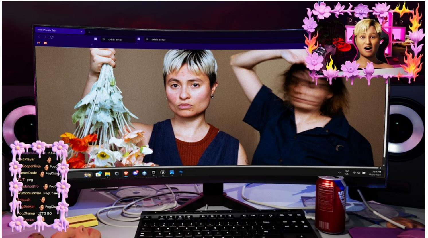
Image description: A desktop monitor on a desk, with a can of coke in front of it. Around the frame of the desktop screen are two superimposed graphics. One is a square video feed of a shocked face of an avatar with blonde hair. The other mimics a live chatstream. Both are surrounded by a flower and fire emoji borders. On the desktop screen is a photograph of two people. One is a person with brown hair, their right arm is raised, and their face is blurry. The other person is staring directly at the viewer, holding an upturned bouquet of flowers.

Image credit: Photograph by Jesse Vogelaar; Design by Sam Mcgilp and Quinn Franks