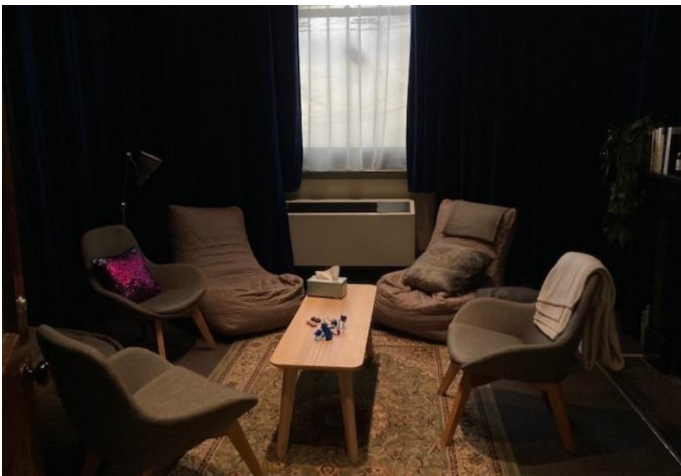
Image: Quiet space with lights dimmed

Arts House Quiet Space is located on Ground Level and is nearby reception and opposite the accessible bathrooms. It includes a range of seating options including soft furnishings, dimmable lights, sensory and stim objects. It is open during venue opening hours and events as a quiet space, prayer or parenting space.