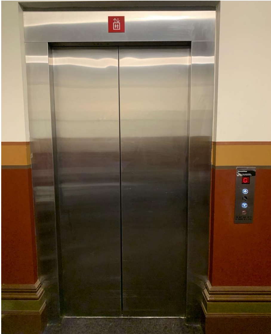
Image: The elevator. Located behind the Box Office desk on the ground floor foyer.

The closest entry to the lift is via George Johnson Lane.