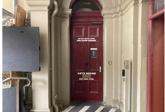
Image: View of door entrance.

Image: Errol Street entrance next to the Post office with wheelchair accessible ramp or two steps with grab rails.