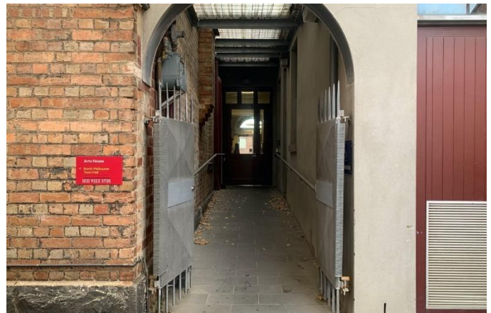
Image: view of the ramp leading from George Johnson Lane to the automated door which opens into the Arts House foyer.

Image: View of George Johnson Lane from Errol St. The laneway passes through an archway with a brick wall at the end.