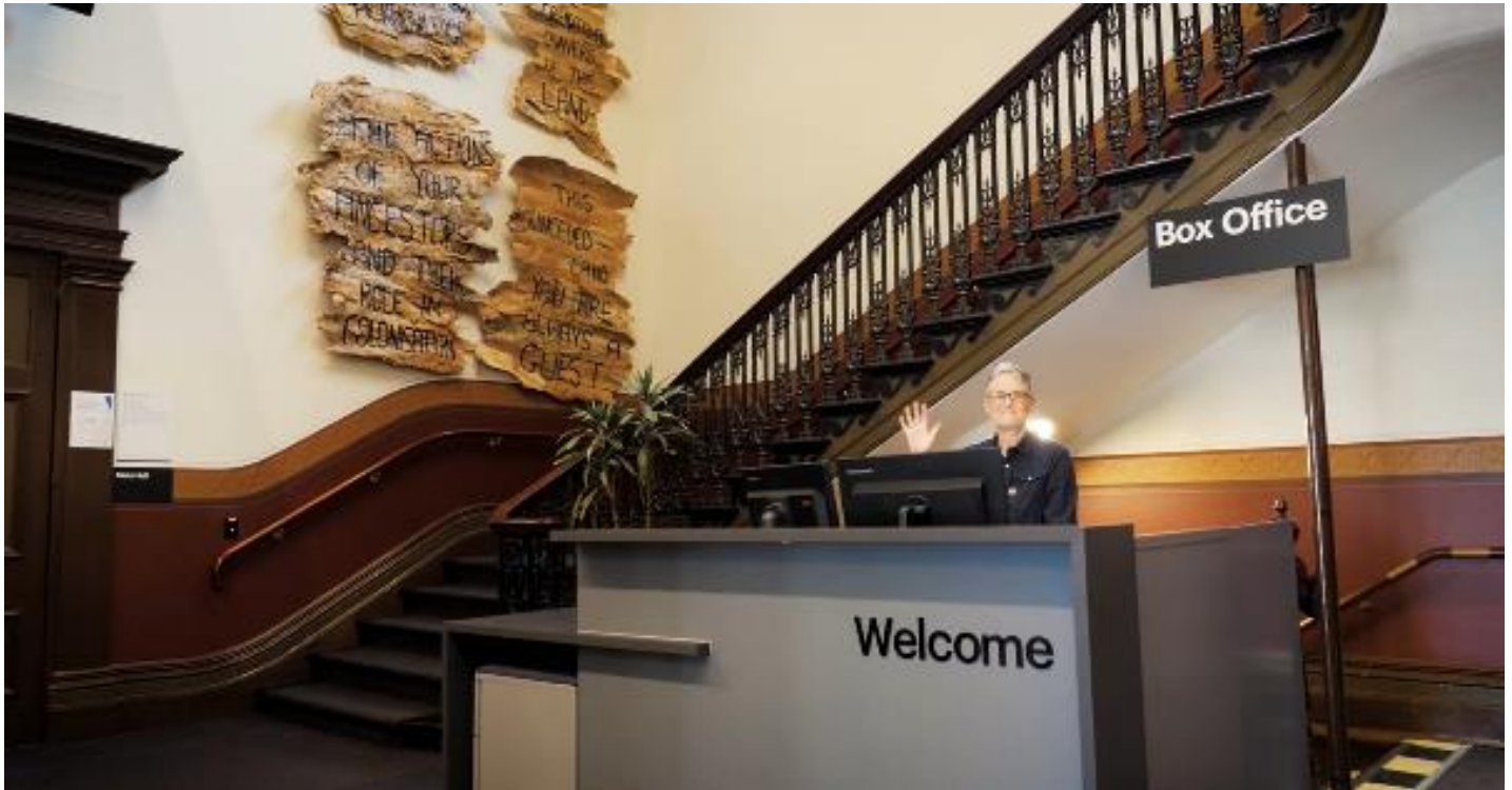
Image: Box Office is located in the foyer under the stairwell.