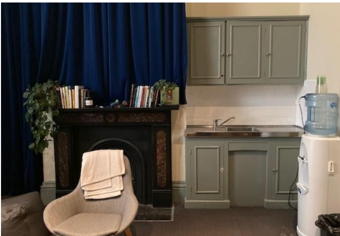
Image: Quiet space kitchenette and book shelf