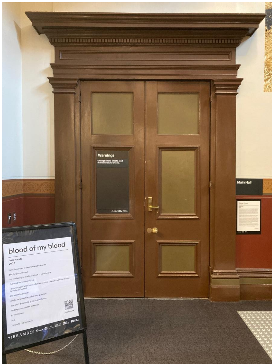
Image: Doors to The Main Hall.

An artist statement is available on signage and warnings on the door.