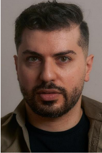
Image description: A headshot of a man looking directly into camera. He has short black hair and a trimmed beard.