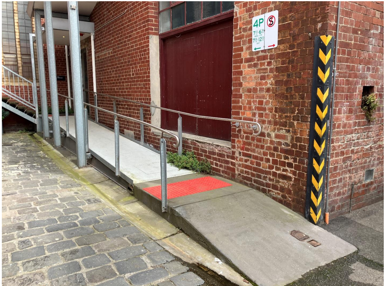
Image: view of the ramp leading to the main entrance of the Warehouse. The bottom section has no handrails. There are handrails either side of the ramp at the top section and a large red tactile surface indicator on the flat middle section. The door to Warehouse is on the right at the top of this ramp.

The main Warehouse entrance has a wheelchair accessible ramp that is 1150mm wide. The bottom section of the ramp has a gradient of 1:6 and has no handrails. The upper section has a gradient of 1:12 and has handrails on both sides.