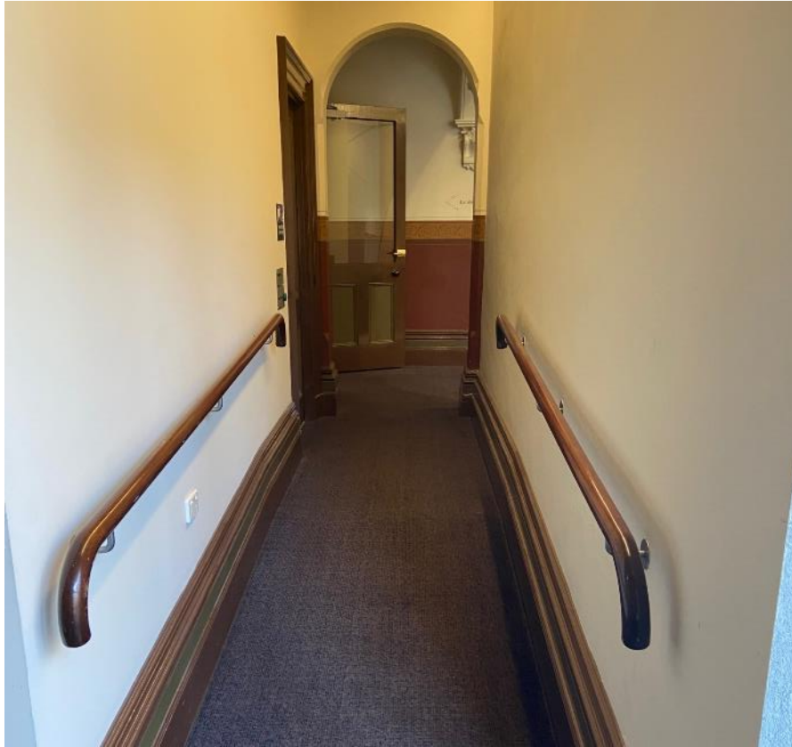
Image: A carpeted hallway with grab rails either side and an archway at the end. Studio 1 is located to the right at the end of this hallway. Studio 2 can be accessed by turning left at the end of this hallway.