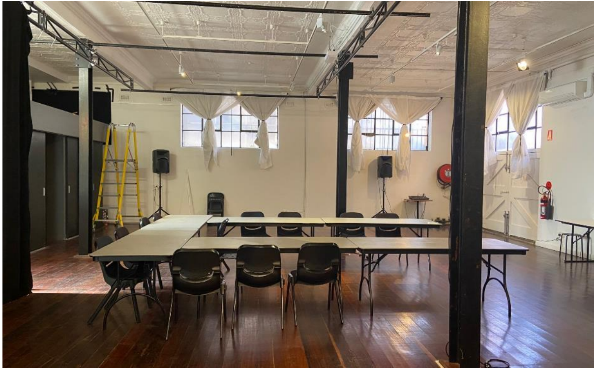
Image: view of the Warehouse space. The hallway to the bathrooms can be seen to the left of the room. The Warehouse has white walls, high windows with white curtains, and dark wooden floorboards. There are four metal poles in the centre of the room. In this picture several tables and chairs are set up in the middle of the space in a U-shape.