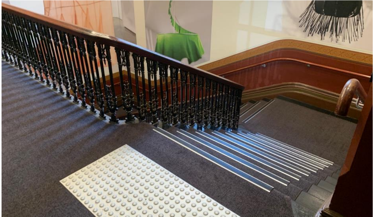
Image: view of the staircase leading to the Ground Floor from the landing on Level 1. The entrance to Studio 1 is straight ahead at the top of these stairs, beyond the tactile surface indicators.