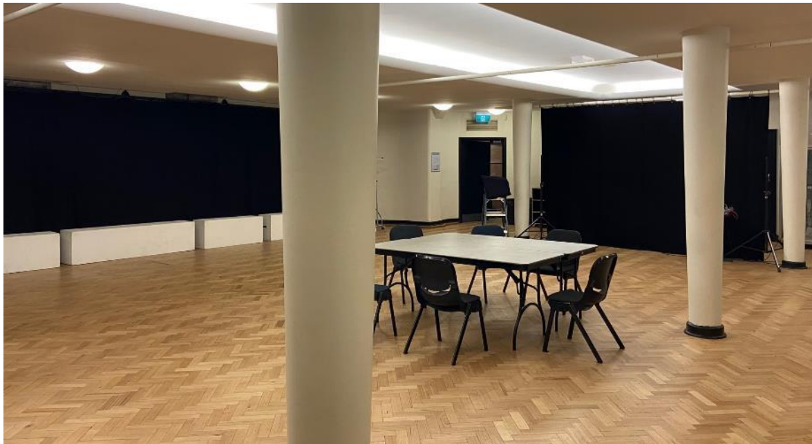
Image: view of Supper Room from main doorway. We can see 3 concrete pillars, evenly spaced across the parquetry floor. There is a table with chairs surrounding it in the middle of the room.