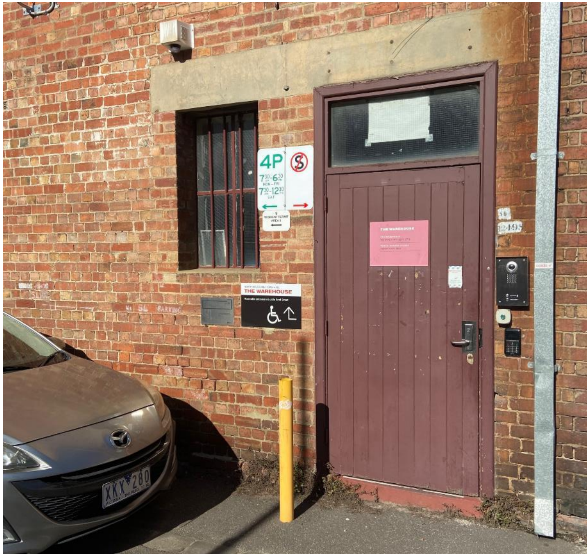
Image: view from the laneway to the rear entrance of the Warehouse, which is an old brick building. This entrance has a maroon-coloured door and a keypad for entry to the right of it. There is a silver car parked directly to the left of this door.