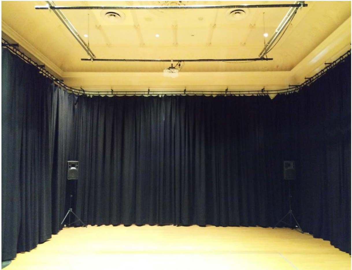
Image: View of Studio 2 with heavy black curtains around three sides of the room. The ceiling is a cream colour and the floor is a light-coloured wood. The lighting rig can be seen attached to the ceiling.