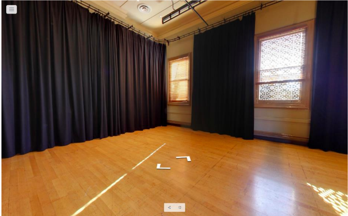
Image: view of Studio 1 looking from inside the room. Heavy black curtains that may be used to black out the room can be seen to the left and in-between two windows.