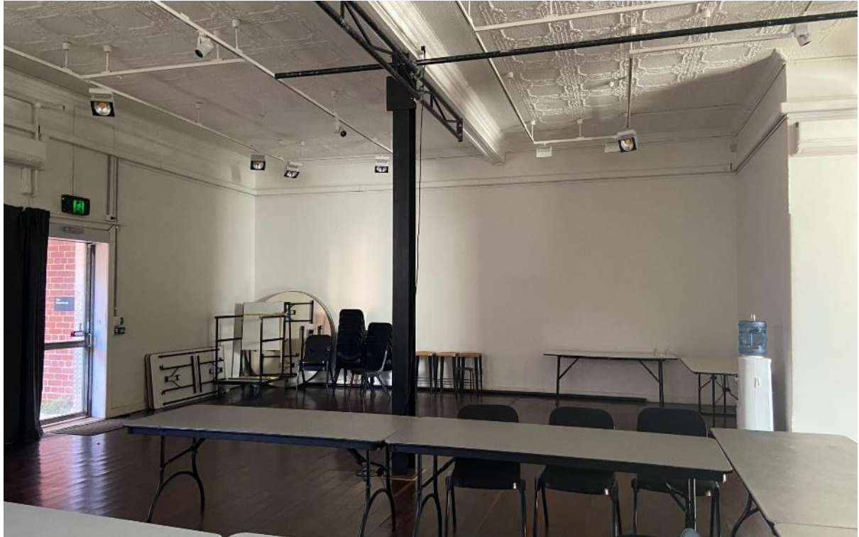
Image: view of the Warehouse space from the doorway of the bathroom corridor. The door to the main entrance can be seen to the left. One of four of the metal poles can be seen in the centre of the room. Several tables and chairs are set up in the middle of the space. There is a water cooler in the right-hand corner of the room and spare chairs stacked up against the far wall.