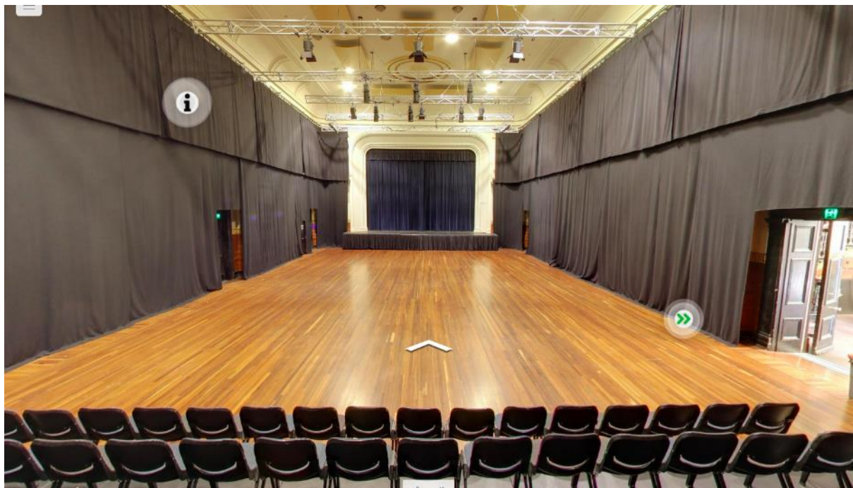
Image: view of main hall from the third row of the seating bank. There is an empty hardwood floor with black heavy drapes pulled around the parameter of the space. A raised stage is visible at the far end of the hall, with black drapes pulled across. The ceiling has ornate fixtures and there are four trusses visible, with theatre lighting.

This space is suitable for large-scale performances, exhibitions, live music events, installations, parties, public talks, gatherings, and more.