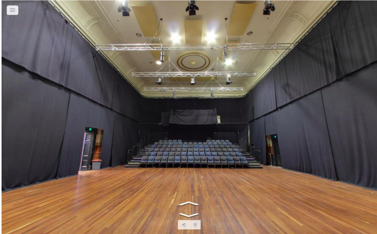
Image: a reverse view of the Main Hall from the stage looking towards the seating bank at the Queensberry Street end of the space. The seats are various shades of blue and grey.