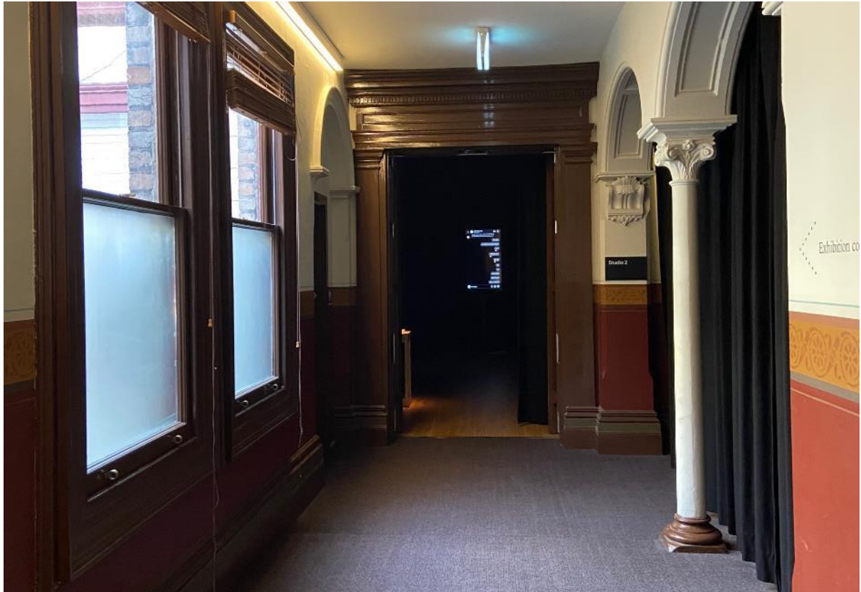
Image: view of the entrance to Studio 2 from midway down the hallway at the top of the stairs on Level 1. There are two windows with natural light coming in from the left, a white pillar and black curtain at the edge of the space to the right and a darkened studio ahead.