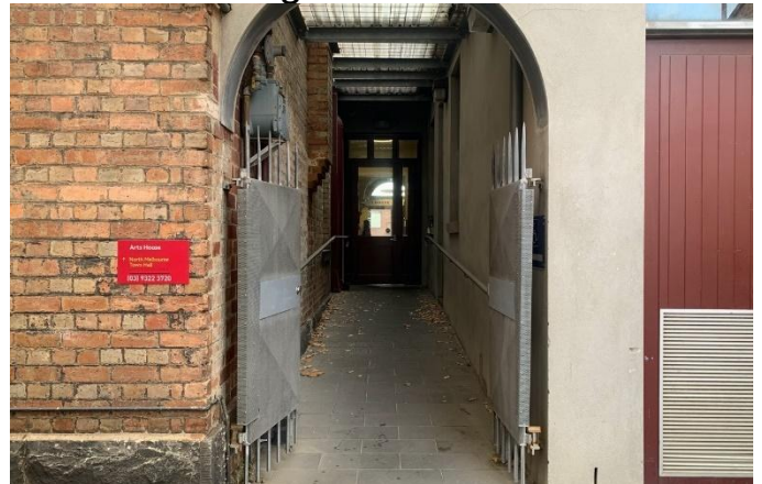
Image: view of the ramp leading from George Johnson Lane to the automated door which opens into the Arts House foyer.

Image: View of George Johnson Lane from Errol St. The laneway passes through an archway with a brick wall at the end.