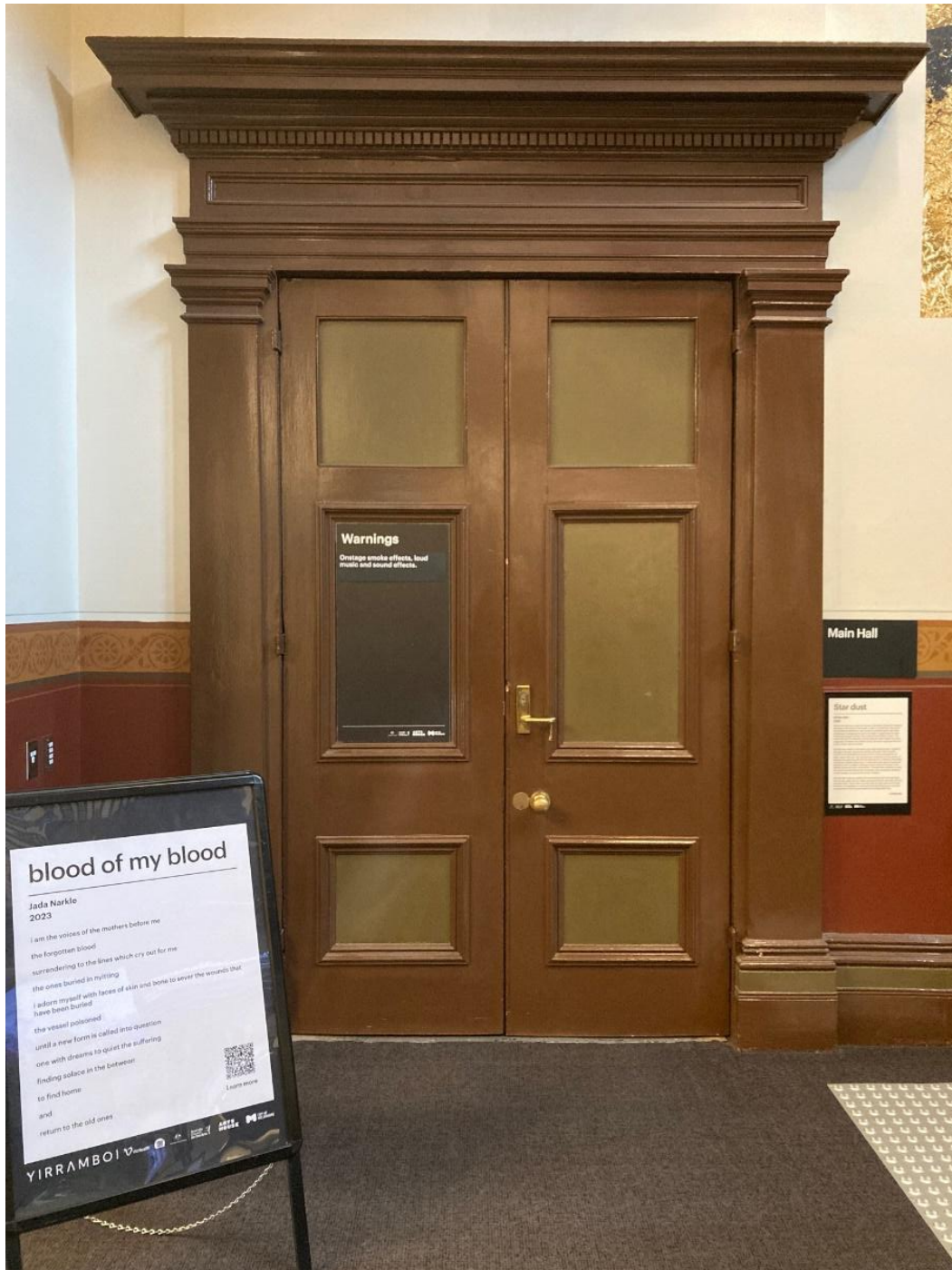
Image: Doors to The Main Hall.

An artist statement is available on a QR code on signage.