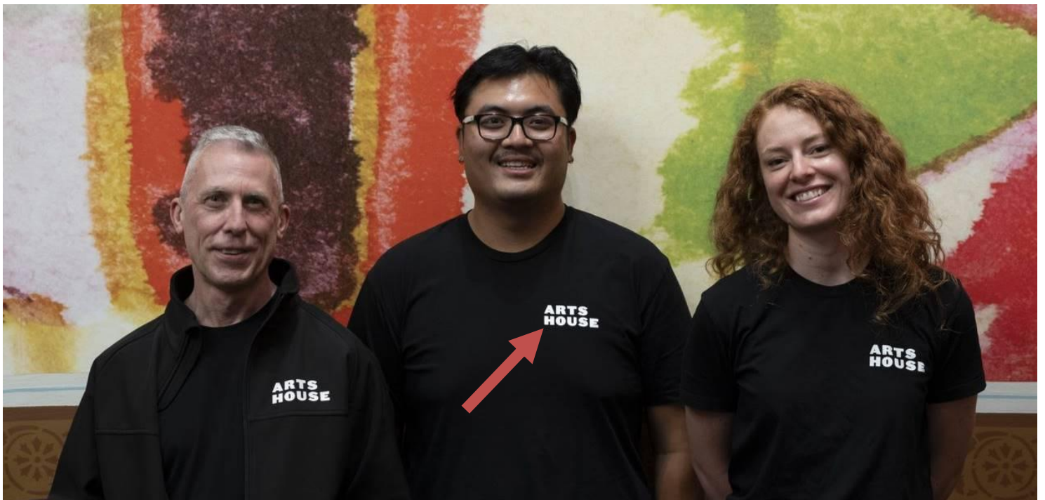
Image: Ushers wearing black with an Arts House Logo on the left hand shoulder.