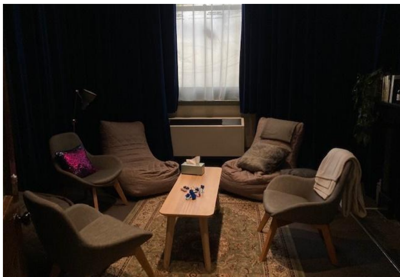
Image: Quiet space with lights dimmed.