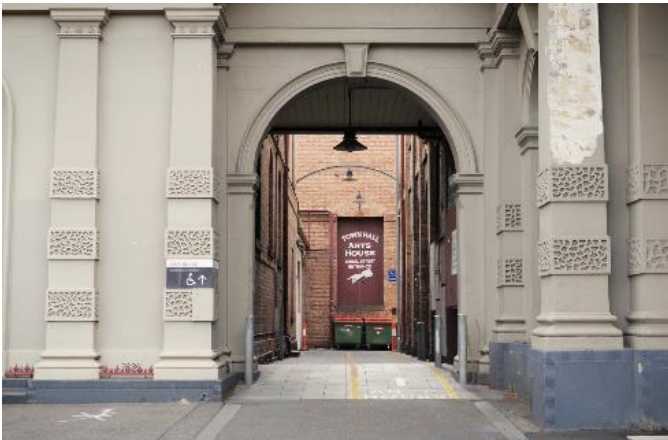
Image: View of George Johnson Lane from Errol St. The laneway passes through an archway with a brick wall at the end.

The second Accessible Entrance is towards the end of George Johnson Lane.