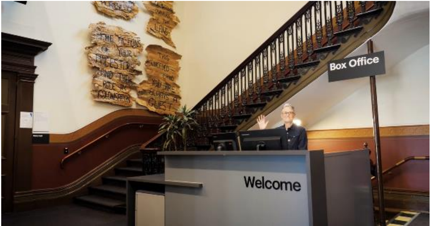
Image: Box Office is located in the foyer under the stairwell.