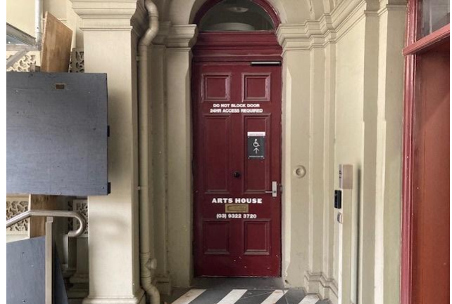
Image: View of door entrance.

Image: Errol Street entrance next to the Post office with wheelchair accessible ramp or two steps with grab rails.