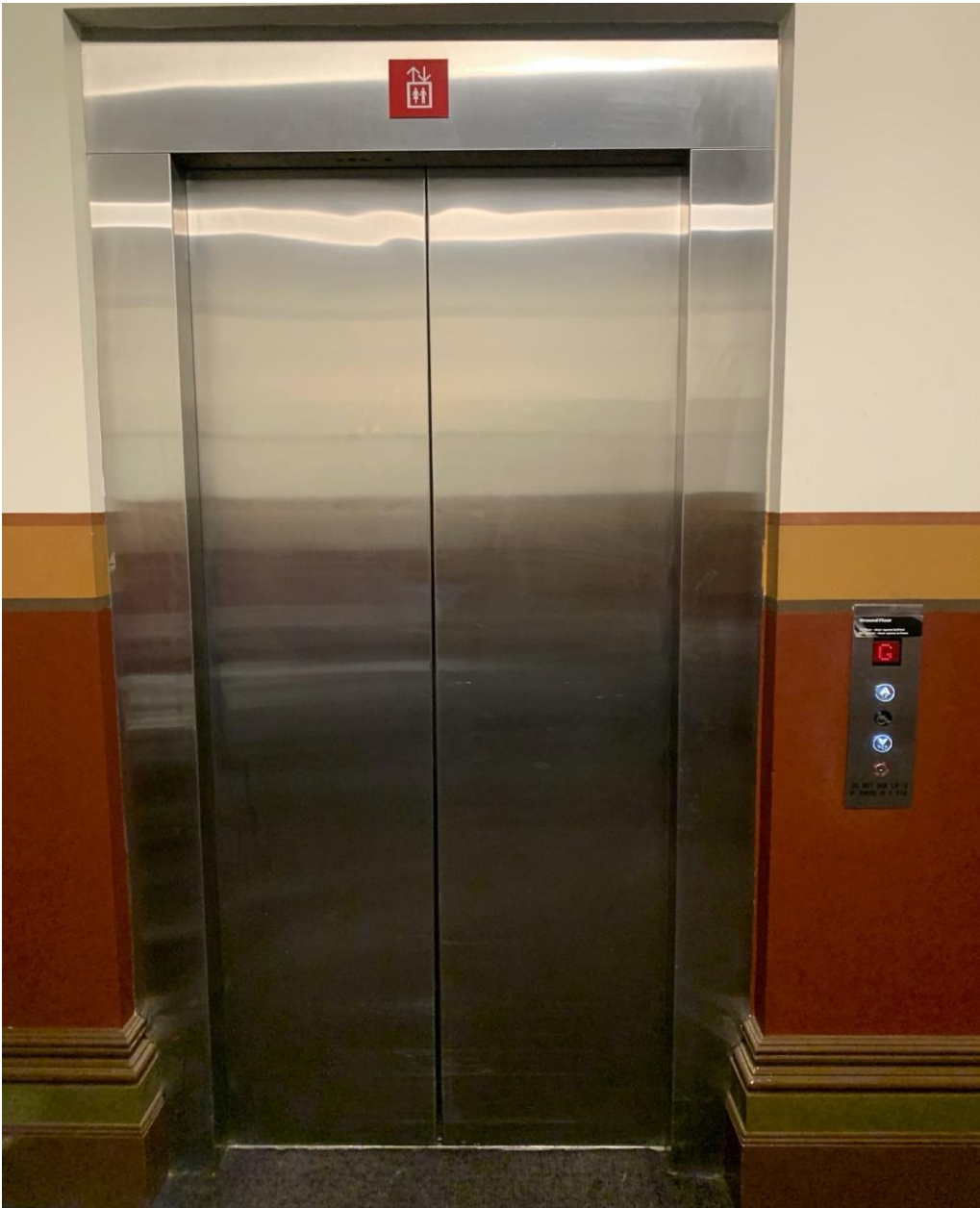
Image: The elevator. Located behind the Box Office desk on the ground floor foyer.

The closest entry to the lift is via George Johnson Lane.