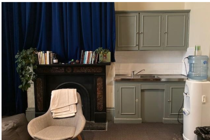
Image: Quiet space kitchenette and bookshelf.

Arts House Quiet Space is located on Ground Level and is nearby reception and opposite the accessible bathrooms. It includes a range of seating options including soft furnishings, dimmable lights, sensory and stim objects. It is open during venue opening hours and events as a quiet space, prayer or parenting space.