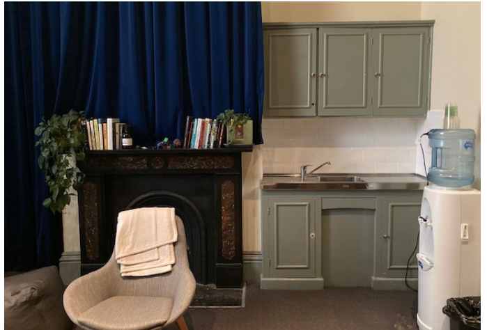
Image: Quiet space kitchenette and book shelf