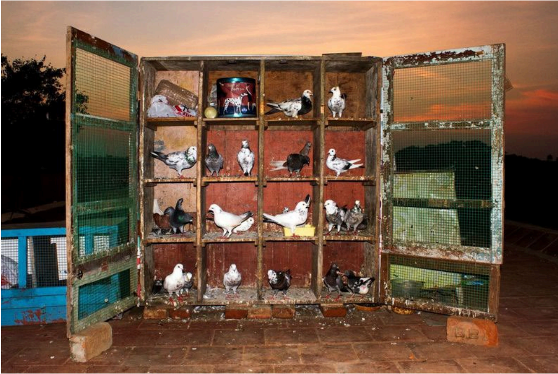
Image Description: A wooden cupboard with square shelves sits on bricks outside. There is a sunset in the background. The shelves have pigeons on them, sometimes two to a shelf.