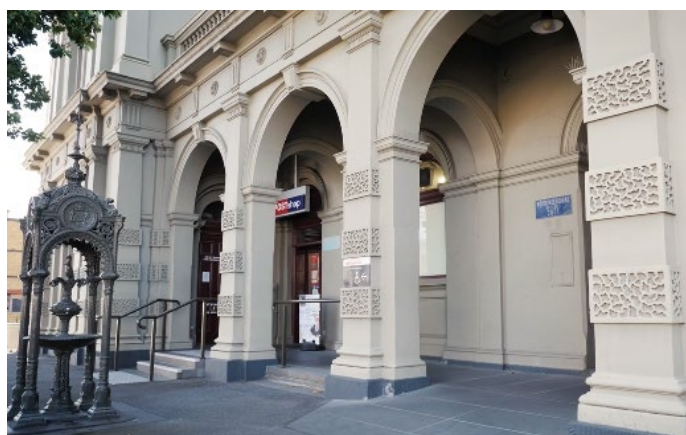
Image: Errol Street entrance next to the Post office with wheelchair accessible ramp or two steps with grab rails.

There are two Accessible Entrances. The first is on Errol St next to the Post Office.