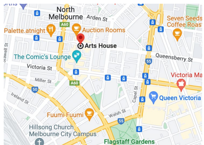
Image: a map of Arts House and its surrounding area. LINK TO MAP