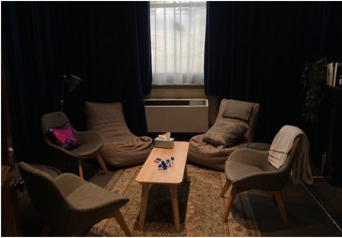
Image: Quiet space with lights dimmed