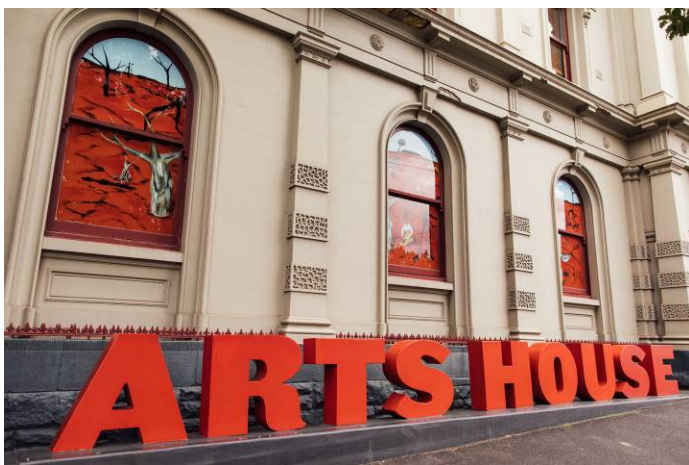
Image: North Melbourne Town Hall features giant red letters that say ARTS HOUSE out the front of it.