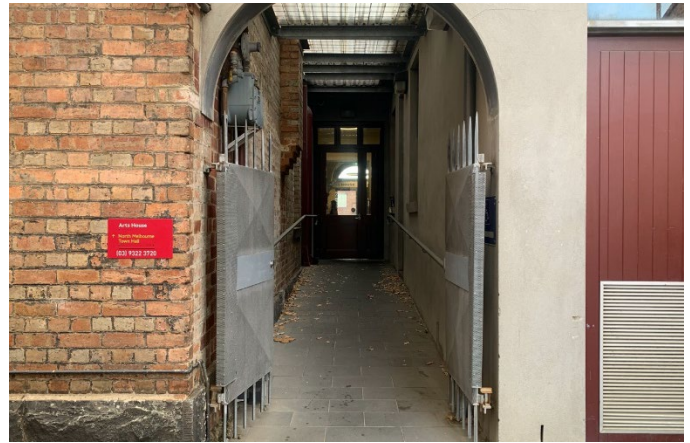
Image: view of the ramp leading from George Johnson Lane to the automated door which opens into the Arts House foyer.