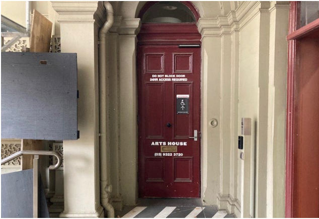
Image: View of door entrance.

The second Accessible Entrance is towards the end of George Johnson Lane.