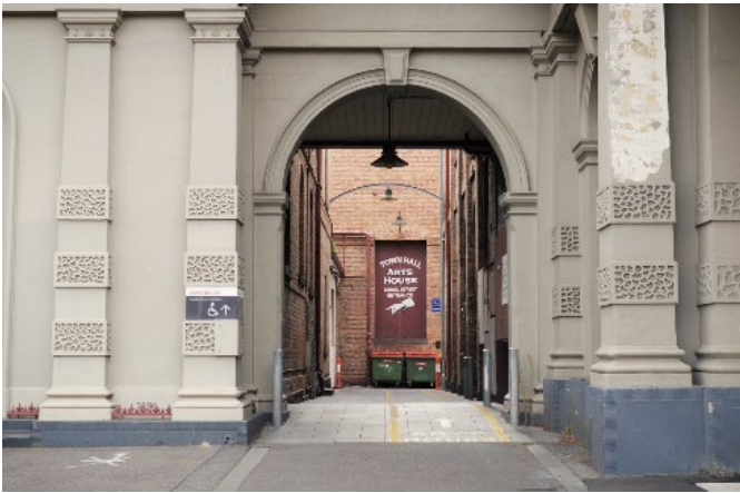
Image: View of George Johnson Lane from Errol St. The laneway passes through an archway with a brick wall at the end.

The second Accessible Entrance is towards the end of George Johnson Lane.