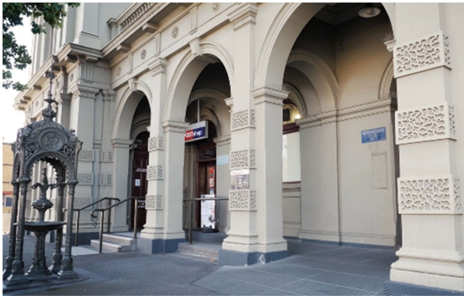
Image: Errol Street entrance next to the Post office with wheelchair accessible ramp or two steps with grab rails.

There are two Accessible Entrances. The first is on Errol St next to the Post Office.