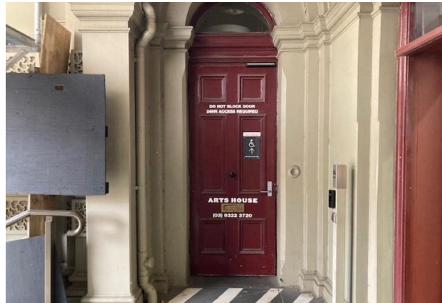
Image: View of door entrance.

The second Accessible Entrance is towards the end of George Johnson Lane.