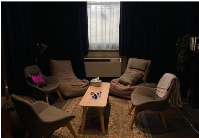
Image: Quiet space with lights dimmed

Arts House Quiet Space is located on Ground Level and is nearby reception and opposite the accessible bathrooms. It includes a range of seating options including soft furnishings, dimmable lights, sensory and stim objects. It is open during venue opening hours and events as a quiet space, prayer or parenting space.