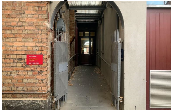
Image: view of the ramp leading from George Johnson Lane to the automated door which opens into the Arts House foyer