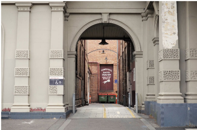
Image: View of George Johnson Lane from Errol St. The laneway passes through an archway with a brick wall at the end.

The second Accessible Entrance is towards the end of George Johnson Lane.