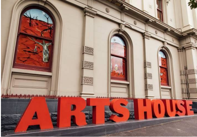
Image: North Melbourne Town Hall features giant red letters that say ARTS HOUSE out the front of it.