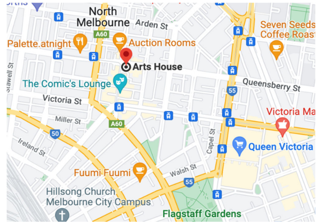
Image: a map of Arts House and its surrounding area. LINK TO MAP