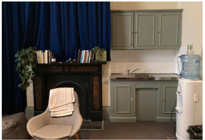
Image: Quiet space kitchenette and bookshelf