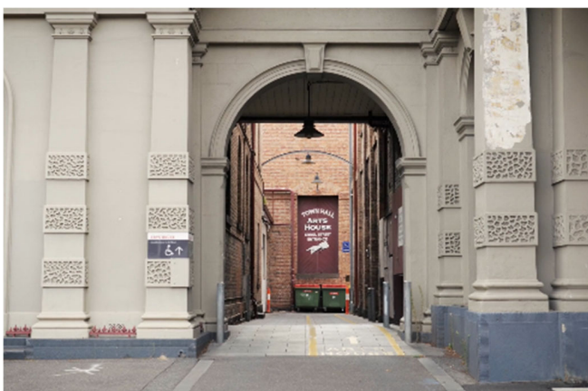
Image: View of George Johnson Lane from Errol St. The laneway passes through an archway with a brick wall at the end.

The second Accessible Entrance is towards the end of George Johnson Lane.