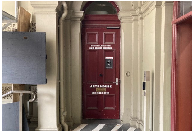
Image: View of door entrance.

The second Accessible Entrance is towards the end of George Johnson Lane.