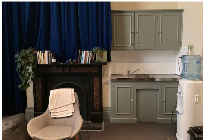
Image: Quiet space kitchenette and book shelf