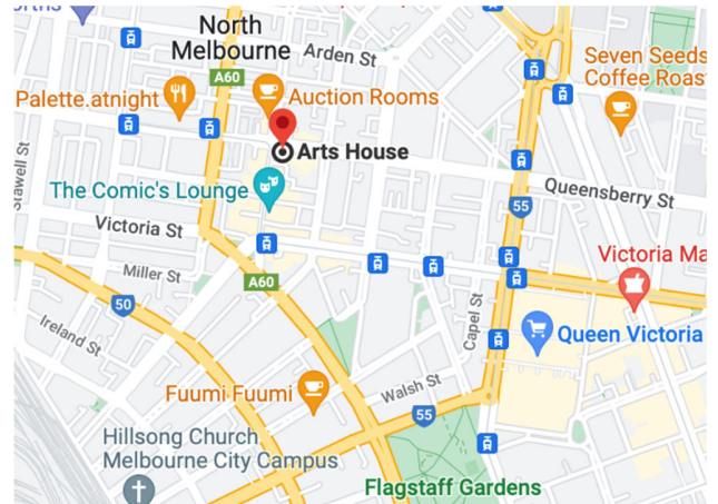
Image: a map of Arts House and its surrounding area. LINK TO MAP