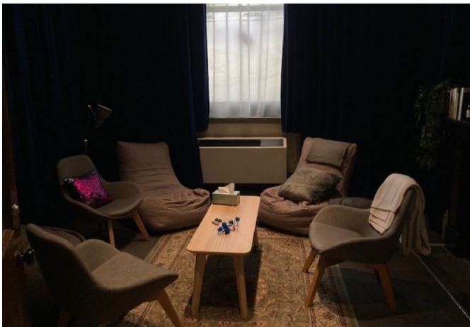
Image: Quiet space with lights dimmed.

Arts House Quiet Space is located on Ground Level and is nearby reception and opposite the accessible bathrooms. It includes a range of seating options including soft furnishings, dimmable lights, sensory and stimulating objects. It is open during venue opening hours and events as a quiet space, prayer or parenting space.