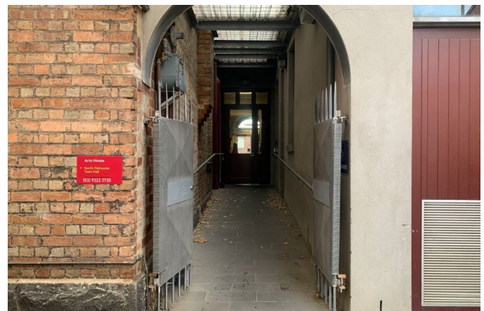
Image: view of the ramp leading from George Johnson Lane to the automated door which opens into the Arts House foyer.