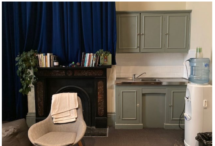
Image: Quiet space kitchenette and book shelf