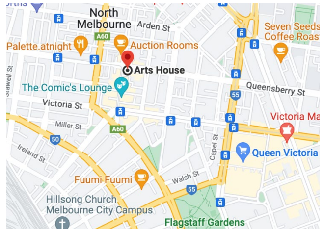
Image: a map of Arts House and its surrounding area. LINK TO MAP

Image: North Melbourne Town Hall features giant red letters that say ARTS HOUSE out the front of it.