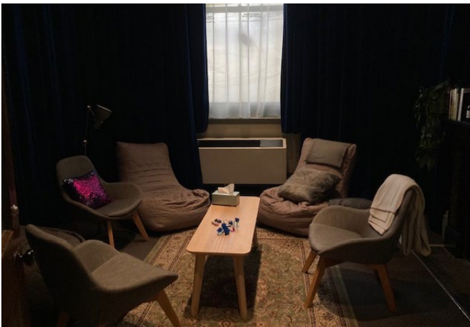
Image: Quiet space with lights dimmed

Arts House Quiet Space is located on Ground Level and is nearby reception and opposite the accessible bathrooms. It includes a range of seating options including soft furnishings, dimmable lights, sensory and stim objects. It is open during venue opening hours and events as a quiet space, prayer or parenting space.