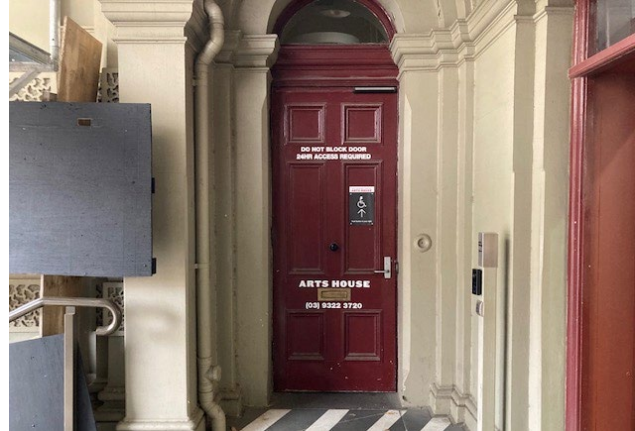
Image: View of door entrance.

The second Accessible Entrance is towards the end of George Johnson Lane.