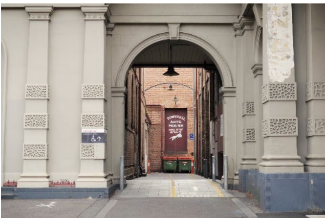
Image: View of George Johnson Lane from Errol St. The laneway passes through an archway with a brick wall at the end.

The second Accessible Entrance is towards the end of George Johnson Lane.