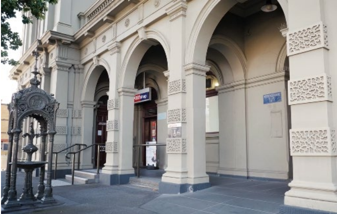
Image: Errol Street entrance next to the Post office with wheelchair accessible ramp or two steps with grab rails.

There are two Accessible Entrances. The first is on Errol St next to the Post Office.