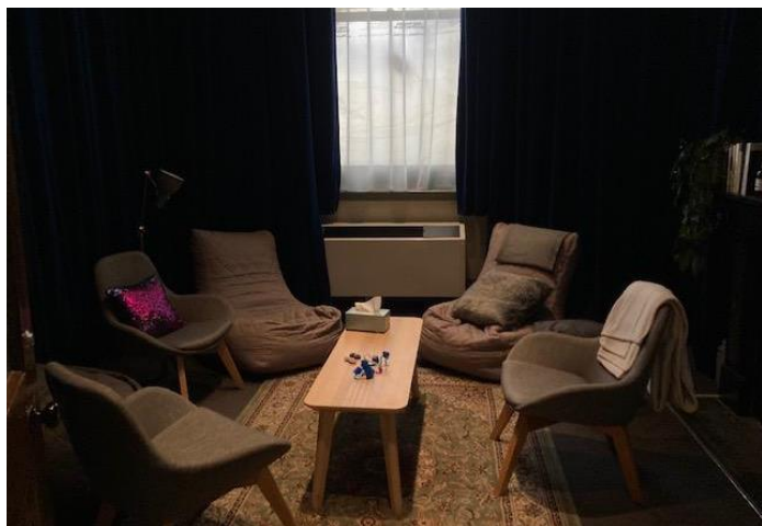
Image: Quiet space with lights dimmed

Arts House Quiet Space is located on Ground Level and is nearby reception and opposite the accessible bathrooms. It includes a range of seating options including soft furnishings, dimmable lights, sensory and stim objects. It is open during venue opening hours and events as a quiet space, prayer or parenting space.