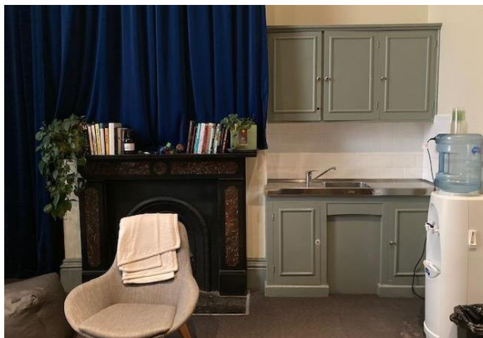
Image: Quiet space kitchenette and book shelf