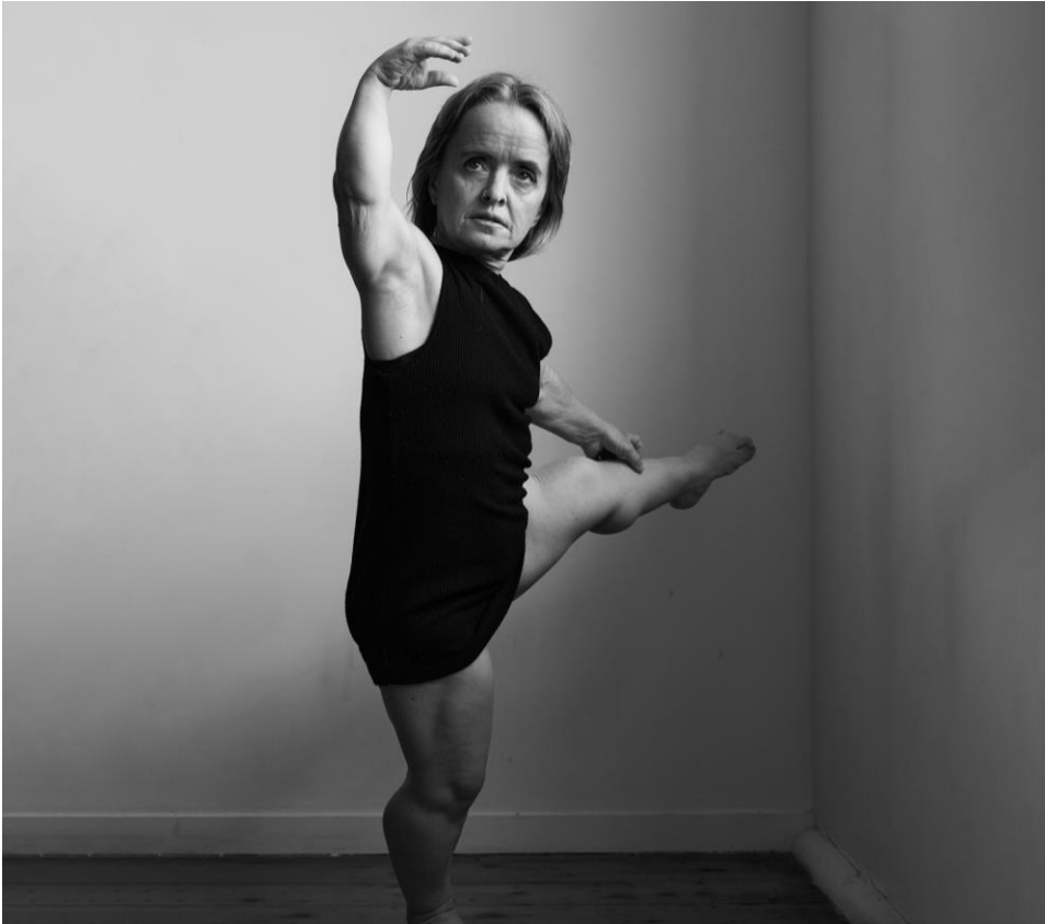
Image Description: A black and white photo of a woman of short stature with light coloured hair in a bob. She wears a long black tank top and lifts her left leg away from the camera with her right hand raised above her head, balletically. She is dancing in front of a white wall, in the corner of a room with wooden floors.