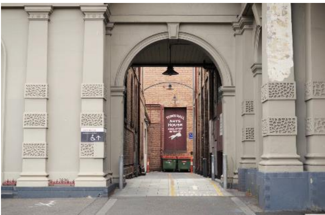
Image: View of George Johnson Lane from Errol St. The laneway passes through an archway with a brick wall at the end.

The second Accessible Entrance is towards the end of George Johnson Lane.