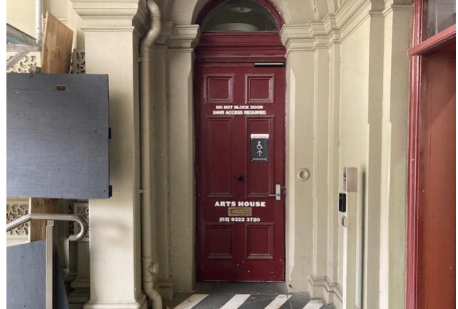
Image: View of door entrance.

Image: Errol Street entrance next to the Post office with wheelchair accessible ramp or two steps with grab rails.