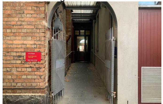
Image: view of the ramp leading from George Johnson Lane to the automated door which opens into the Arts House foyer.

Image: View of George Johnson Lane from Errol St. The laneway passes through an archway with a brick wall at the end.