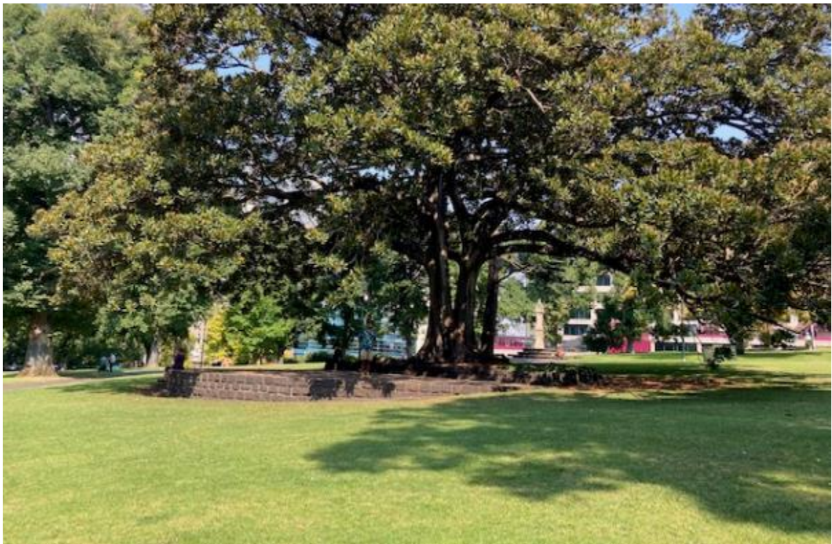
Image caption: this grassed area is where we will gather and perform together. It is next to a cobblestone stage with a large mature tree which casts shadows over the verdant grass.