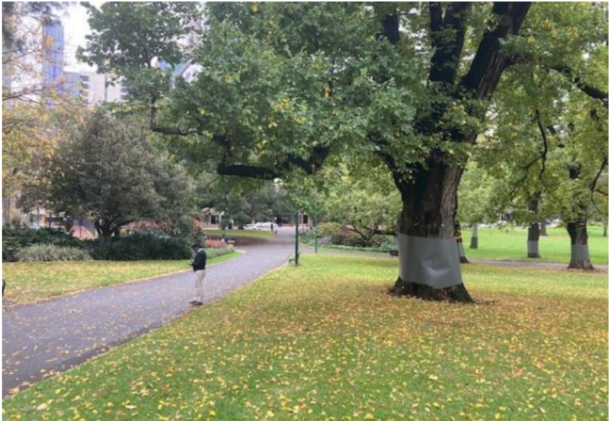
Image caption: Front of House point for event entry will be alongside directly next to a large tree. This area will be fenced with orange bollards with SES tape around the edge.