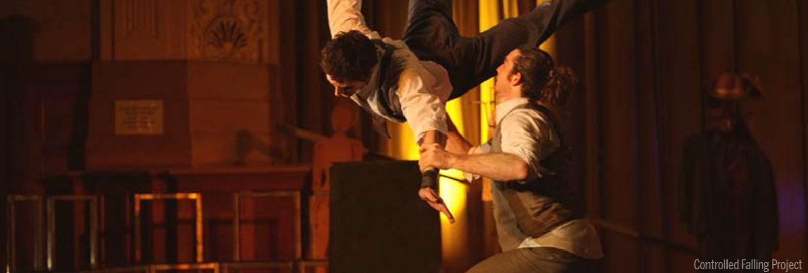
Controlled Falling Project